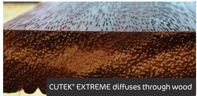
CUTEK® EXTREME diffuses through wood