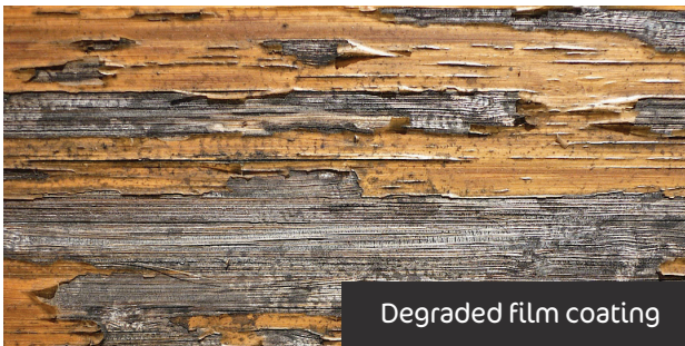
Degraded film coating