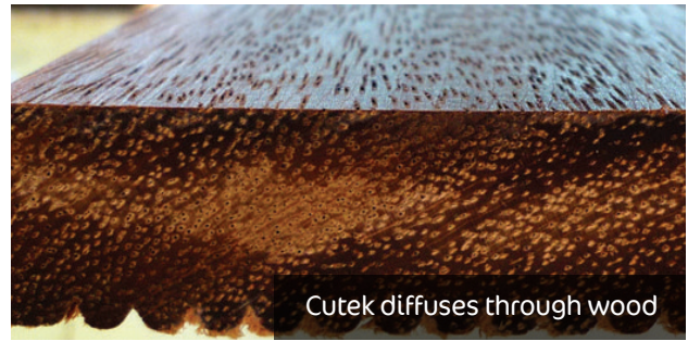
Cutек diffuses through wood